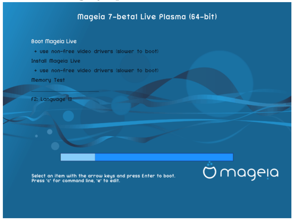
BIOS kipinde önyükleme yapılırken ilk ekran